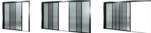
Single slider Double slider Stacking slider