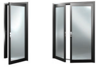
Single door French doors